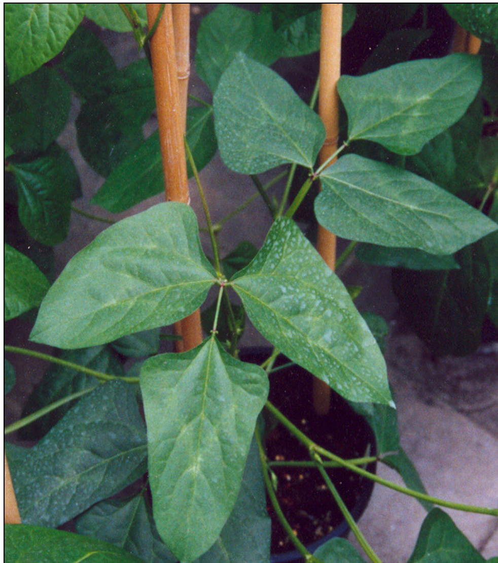
Figure 1. The F_1 ( pubescens ♀) × IT84S-2049 (♂) hybrid line presenting the sub-hastate terminal leaflet shape and V marks on leaflet characteristics.